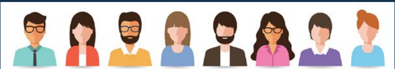
Public Indirect Reporting from surrogates such as Foreign Consulates

The incident specific public website is now available, and the public begins reporting Unaccounted For and Safe persons through the website and text messaging, as well as accessing incident specific information shared by the PIO